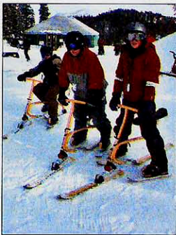
Snow bikes are bike frames that sit on short skis. The rider wears even shorter skis and turns with one's feet and the handle bars.

What some skiers miss at Keystone is that old-fashioned look of historic ski towns like Telluride, Aspen and Park City, all 19th-century mining camps. But purpose-built resorts like Keystone have other benefits. Designed for skiing, they're not hampered by historic restrictions or a lack of growing room. Keystone's current four-year redevelopment plan for the Mountain House base incorporates state-of-the-art design and technology.