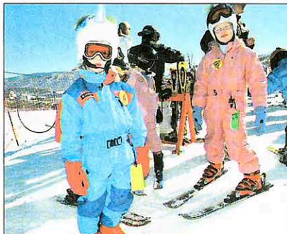
Let's be careful out there! Ski lessons are about to begin.

Now in its 38th year, Keystone seems to defy age, staying young with a popular and progressive kids' ski school, state-of-the-art grooming, 1,600 rental condos and annual tweaks to already ample skier fa-