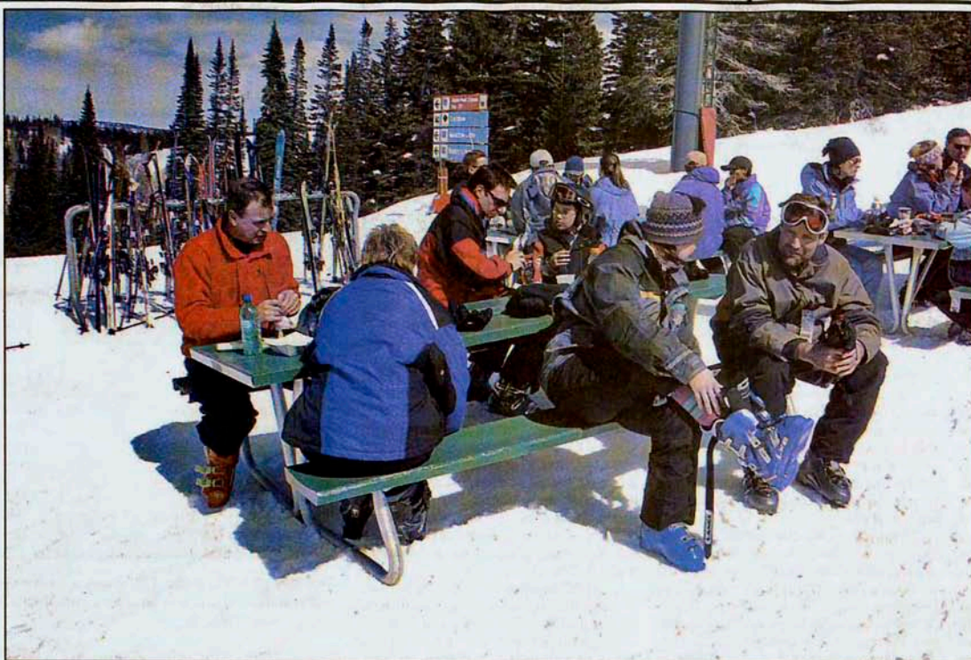
Ski racks, picnic tables, snacks and sunshine make for a pleasant respite at the Four Points Hut in Steamboat Ski Resort.

Equally popular is the "Kids Ski Free" program. The best deal in the country, it's designed to make it affordable for parents who ski to bring their children along, too. For every adult who buys a five-day lift pass, or a ski and boot rental, a child aged 6-12 gets one free. On some packages, even the airplane tickets are free. For