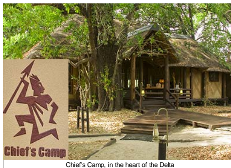
Chief's Camp, in the heart of the Delta

At 4 p.m. as the temperatures cool, the afternoon game drives begin. Male lions awake and stretch, lionesses hunt, leopards climb down from their trees and elephants and antelope move onto grassy meadows. As the sun sets, you stop on the trail for a class sundowner – wine, spirits, beer, crackers and cheese on the tailgate. As dusk falls, male lions begin to roar, hyenas cackle and the ponds are alive with a deafening chorus of frogs.