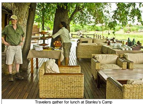
Travelers gather for lunch at Stanley's Camp

To protect this unique ecosystem from being loved to death, Botswana's government adopted an enlightened policy. It divided the Delta into individual districts and leased the rights to bring in tourists to a few approved tour companies. Each outfit owns and/or operates its own lodges within its own sector, and must conform to a general set of regulations.