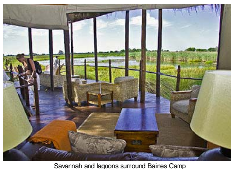
Savannah and lagoons surround Baines Camp

Most travelers visit three lodges, staying several days in each. We added a fourth, going from Chief's Camp , to Stanley's Camp , to Baines Camp and finally to Chobe Chilwero , south of Victoria Falls. On each transfer day, you pack your bag early and join the morning game drive as usual. Afterwards, your guide drives you to the air strip, usually a grassy field, where a high-wing single-engine plane lands and delivers arriving guests. Your bags are loaded, you buckle up, the plane takes off and 30 minutes later you're eating lunch at the next lodge on your itinerary.