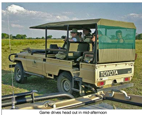
Game drives head out in mid-afternoon

To minimize scarring the fragile terrain, all lodge structures – the main lodge, adjacent guest cabins, employee housing, kitchens and laundry – are constructed of canvas tents bolted onto multi-level wood decks. Usually, the living and lounge areas, bar area, library corner, dining area, gift shops and internet space are arranged under several large, connected, open-sided tents. Each guest cabin is closed, with screened walls, a front porch and door, bedroom, sitting area and private bath.