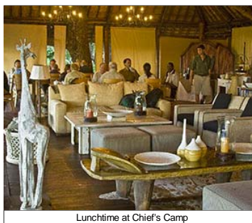
Lunchtime at Chief's Camp

By 8 p.m., you're back in camp and gathering for dinner, a leisurely four-to-five course meal served with wine at family-style tables. The travelers, numbering from eight to 26, depending on the lodge, compare the day's wildlife sightings before heading to bed – escorted by a guide.