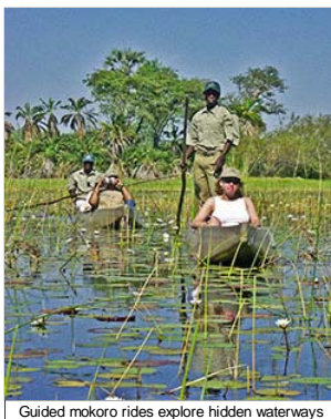
Guided mokoro rides explore hidden waterways