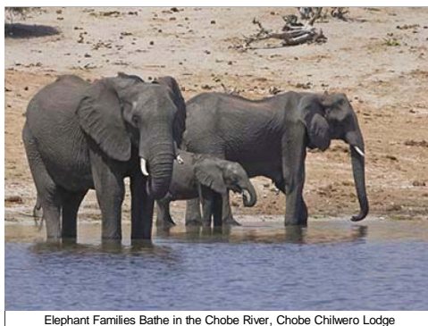
Elephant Families Bathe in the Chobe River, Chobe Chilwero Lodge