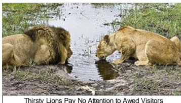
Thirsty Lions Pay No Attention to Awed Visitors

What's a wildlife safari all about? First, it's a chance to see Africa's "Big Five," – elephants, lions, hippos, rhinos and African buffalo – with an experienced guide and from the safety of an open-sided all-terrain vehicle. We spent an hour quietly watching a pride of lions 12 feet from the rear fender, and crept past rhinos grazing at 50 feet. Baboons barked as we approached and clutching their babies, scampered toward the nearest trees. Giraffes turned their heads to watch us, and we stopped to watch them.