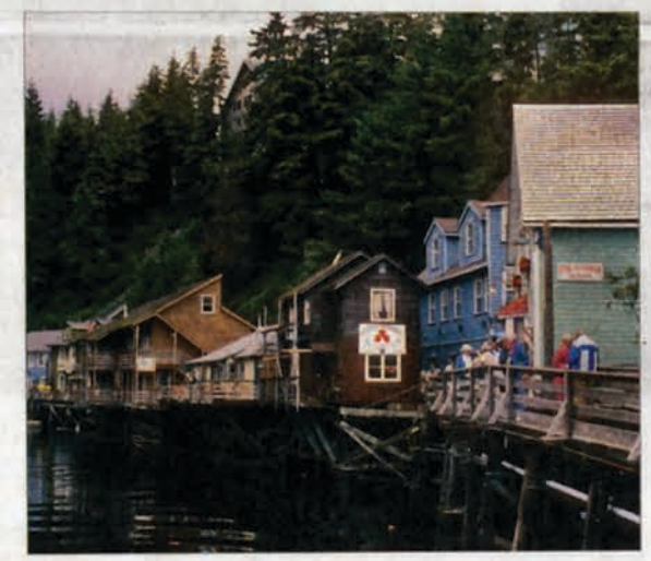
Longer trips often mean visits to cities, including Ketchikan.

(78), Spirit of Discovery (84), Spirit of Endeavor (78), Spirit of Yorktown (138)