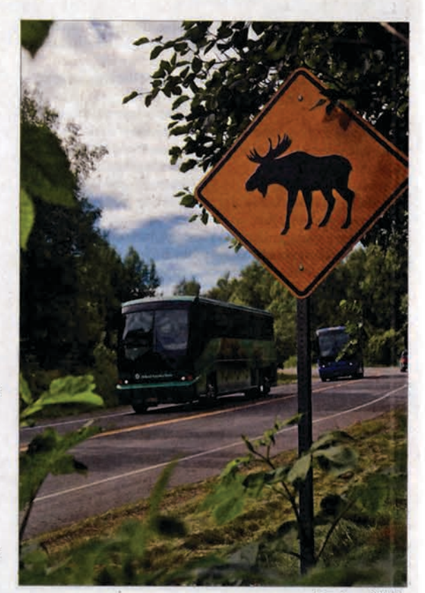
Gray Line of Alaska