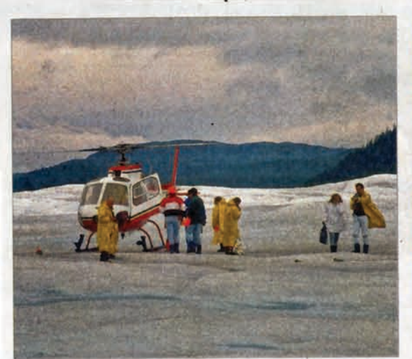
Many cruise deals include the opportunity to sightsee on tours by helicopter.