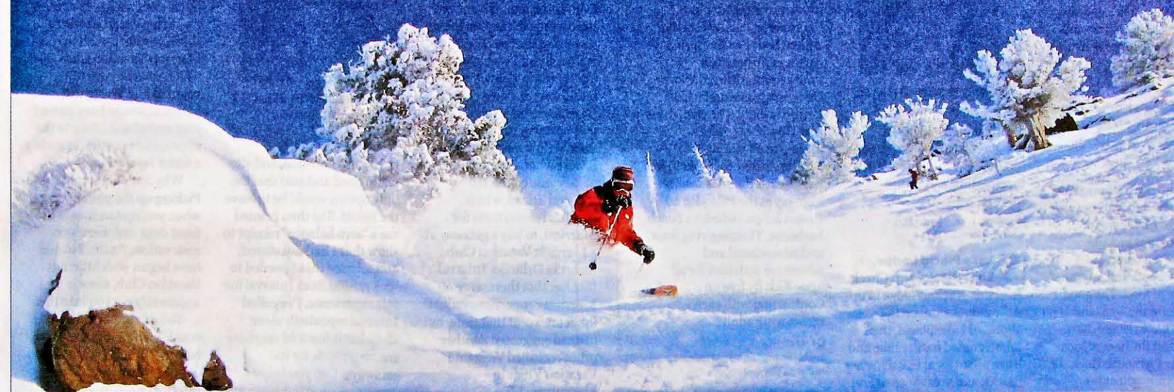
Snowbird Ski and Summer R

Find predictably fine flakes at these resort areas