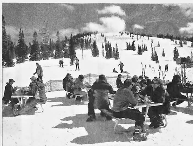
Steamboat Resort skiers take a break at the Four Points Hut on Storm Peak amid the region's legendary powder.

If the winter looks like a blockbuster, you'll know by January, in time to plan a ski trip during nonholiday weeks