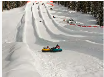
FUN IN THE SNOW

Some non-ski activities are offered by the ski resorts themselves; others, like horse-drawn sleigh rides and fly-fishing, are provided by outfitters, suppliers or concessionaires who have specific expertise. Reservations are advised, since many, like dog-mushing and paragliding, are in demand. All charge a separate fee.