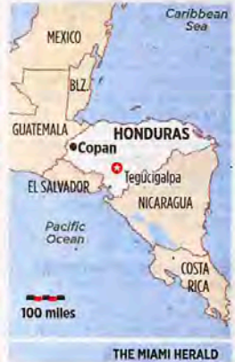
THE MIAMI HERALD

For an uneasy moment, the sight of the finest architecture of its day invited a comparison to a future century when archaeologists