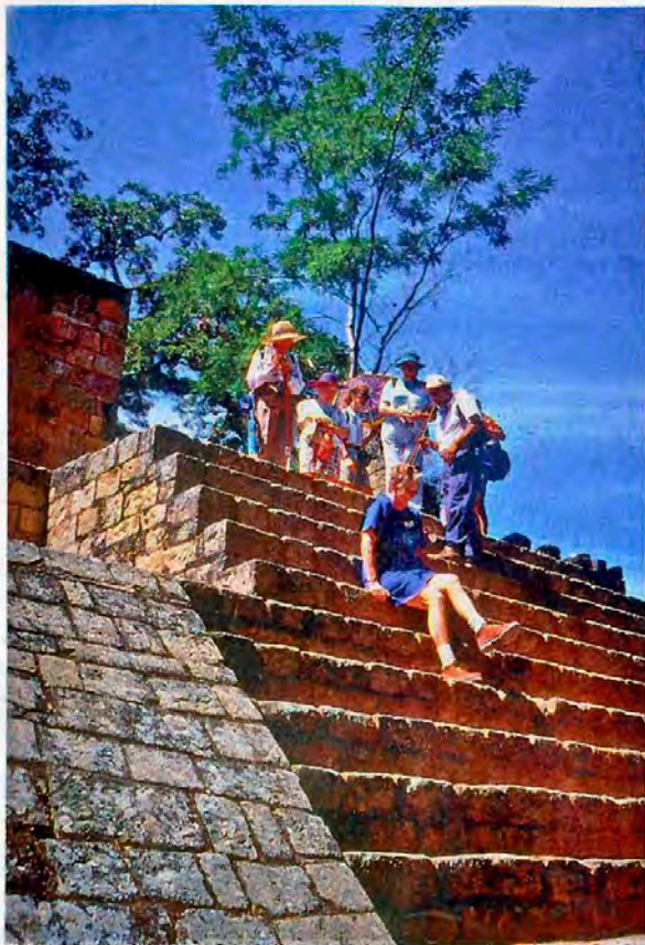
STAIRCASE TO HEAVEN: Visitors are faced with a steep descent from Temple 11 at the Mayan World Heritage Site.