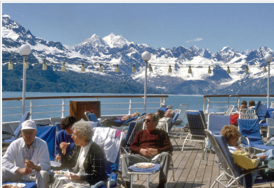
Passengers catch some rays cruising near Seward, Alaska.