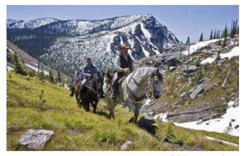
Spring snow covers the Middle Fork of Monture Creek, below Deadhorse Lake, at The Encampment at Bull Creek, run by Resort at Paws Up, deep in the heart of Montana's Lolo National

With the corral receding behind us, we headed through the trees for a seven-hour ride that wound through the deep shade of old forests, crossed burned-out moonscapes (scenes of the previous year's forest fires), climbed alpine valleys and ascended rocky canyons. In midafternoon, we reached the Monture River, following it into camp.