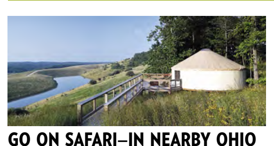
Wildlife conservation center has the goods.