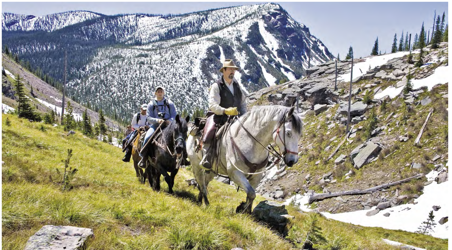
Guests of Resort at Paws Up can saddle up and make the ride to the property's luxury tent camp, which is called the Encampment at Bull Creek.