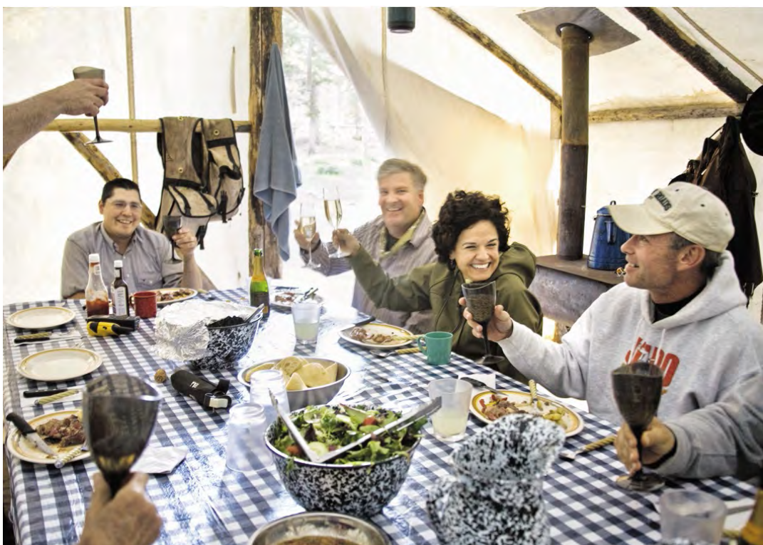
at The Encampment at Bull Creek, Resort at Paws Up, Greenough, Mont.

wine tasting. View bald eagles as they soar overhead. Leaves Tues.—Sun. at 10:00 a.m., returns 4:30 p.m.