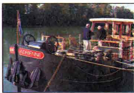
Crew members prepare the Adrienne for departure.