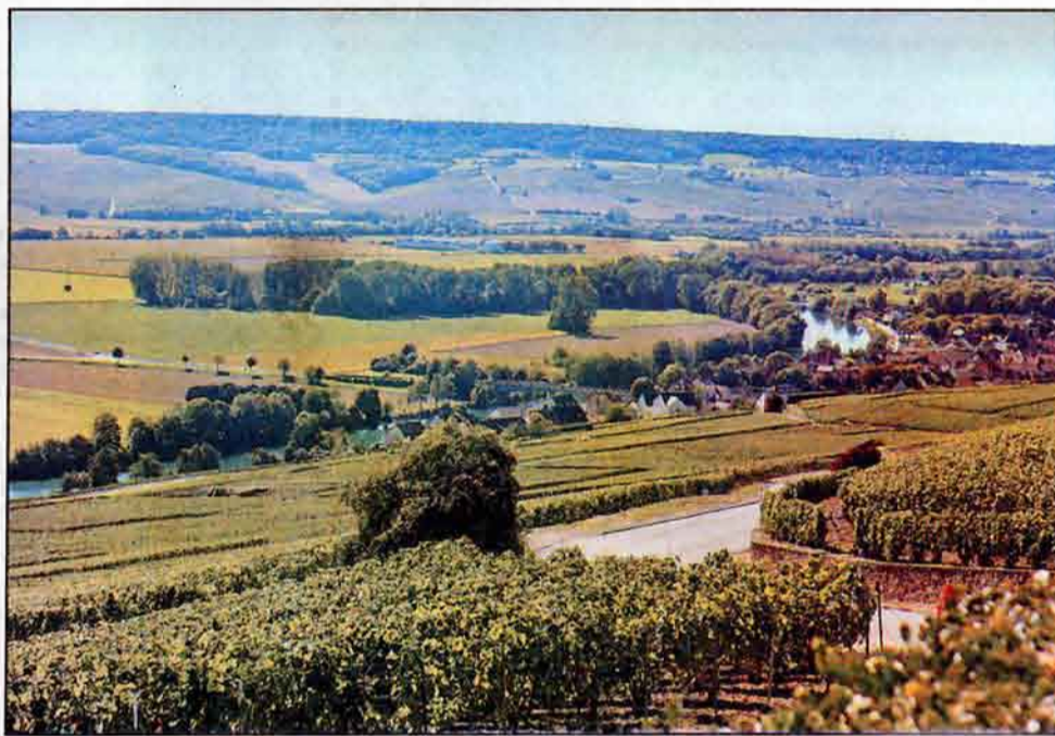
Vineyards dominate the view in the Champagne region of France.

On our first full day, we spent a long morning touring battle sites from World Wars I and II, including those at Chateau-Thierry and in Belleau Wood.