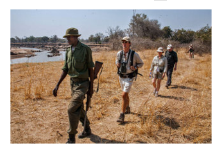
Along the river, it's single file for safety.