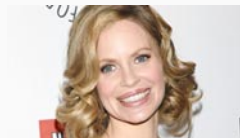
'True Blood' actress favors South Africa