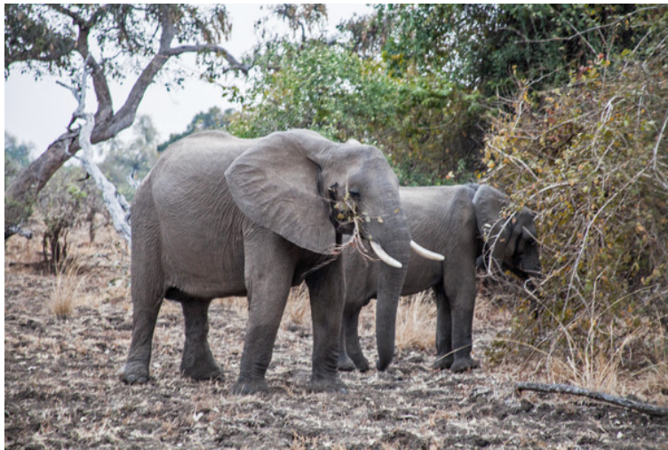
A zoom lens catches these elephants unawares.