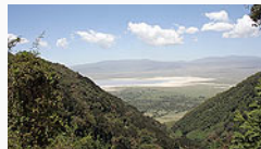
On safari in Tanzania: a 'unique, amazing place'