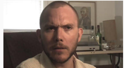
Viral video: A conversation with his 12-year-old self