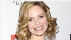
'True Blood' actress favors South Africa