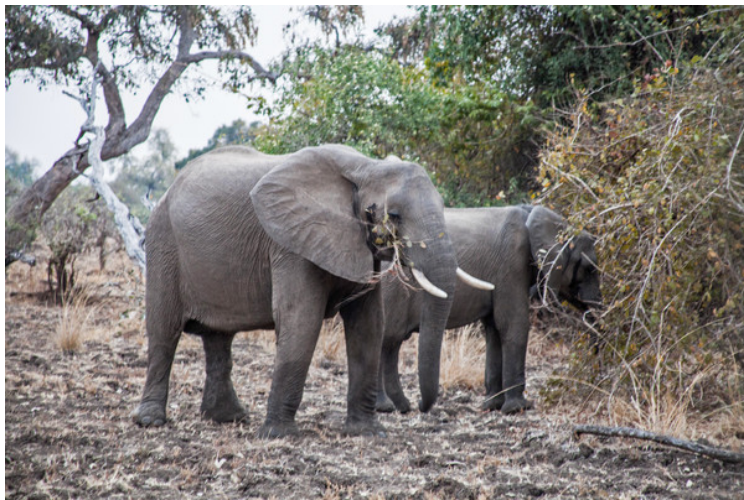
A zoom lens catches these elephants unawares.