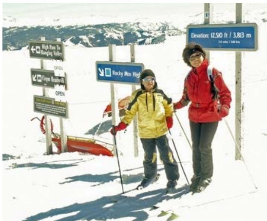
Two skiers catch their breath at Snowmass' high point, the Cirque – elevation 12,510 feet.

FRASER, Colo. — The trees are bare, the snow is falling somewhere, it's time to ski. But where?