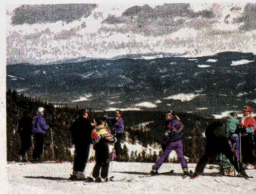
Skiers congregate at the top of the Alice-in-Wonderland trails in Winter Park Resort. MCT

glide away to the nearest lift line. At Snowmass Resort, you'll be "livin' large" when you stay in one of the resort's 2,400 rental units (with beds for 8,750 skiers) clustered around the two main base villages.