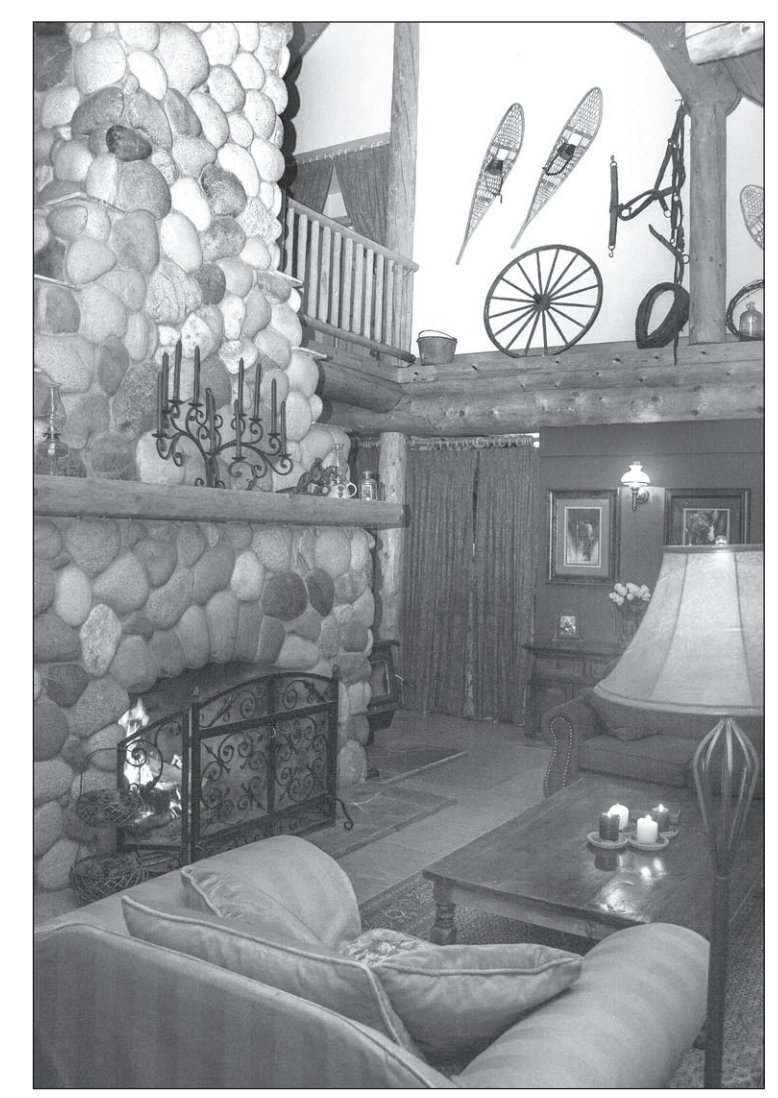
River stones and Canadian peeled spruce logs dominate the living room and fireplace at Siwash Lake Ranch.