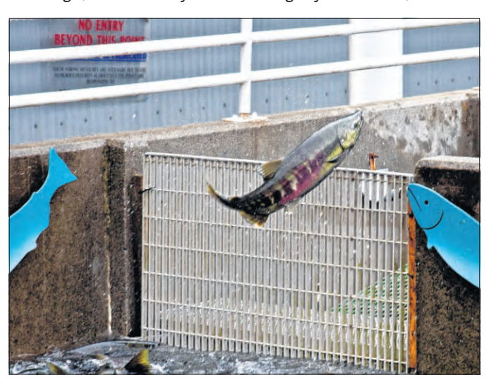
Spawning salmon leap the fish ladders at the Macaulay Fish Hatchery in Juneau, Alaska.

The onboard naturalists on our trip — experts in marine biology, geology, regional and led the daily pre-excur- standing by the rail, talking history or native cultures guided most onshore outings with spot-on timing. We were a giant chunk of ice calved off