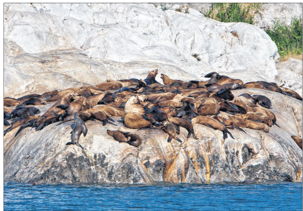
Sea lions, sprawled on an islet in Glacier Bay, are wildlife eye candy for passengers on the Sea Bird.