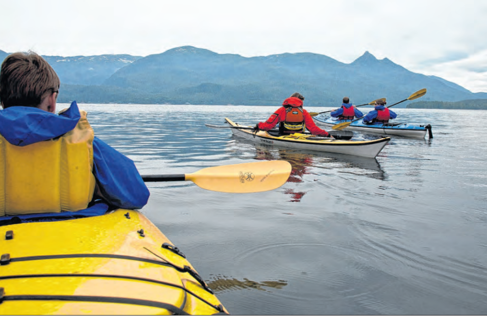
Passengers adventure off the ship to kayak, exploring coves in the Tongass Narrows on Revillagigedo Island. Un-Cruise Adventures includes "active" itineraries for cruisers who want to join the action.