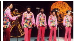
A look back at some of the famous folks we lost this year