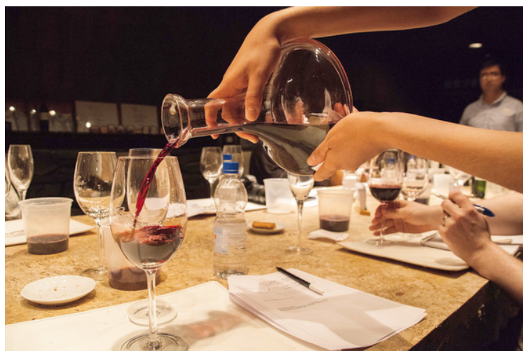
A tasting of Malbec is poured at the Graffigna Winery in San Juan Province, Argentina.

Comments 0 | Email | Share 0 | Tweet 0 | Tweet 0