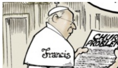
New Pope elected