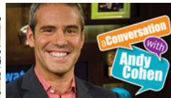
Don't miss Bravo's host dish on Hollywood's best gossip