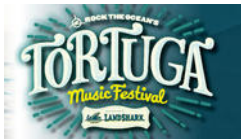
Win VIP tickets to see Kenny Chesney and more