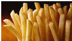
Browse quickly the worst foods you can feed your child