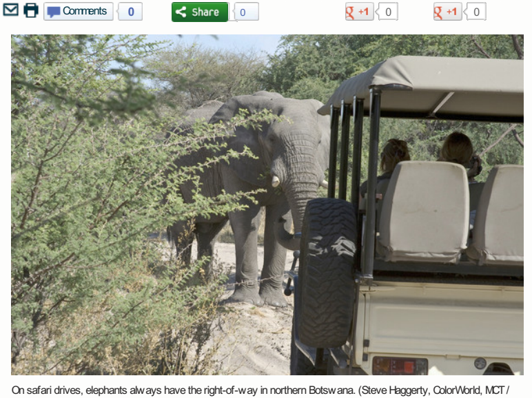
on sarah drives, elephants always have the right-of-way in northern botswaria.