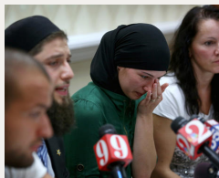
Islamic group: Slain man was unnamed, shot by FBI agent 7 times