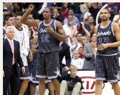
Grant Hill's retirement leaves painful memories in Orlando