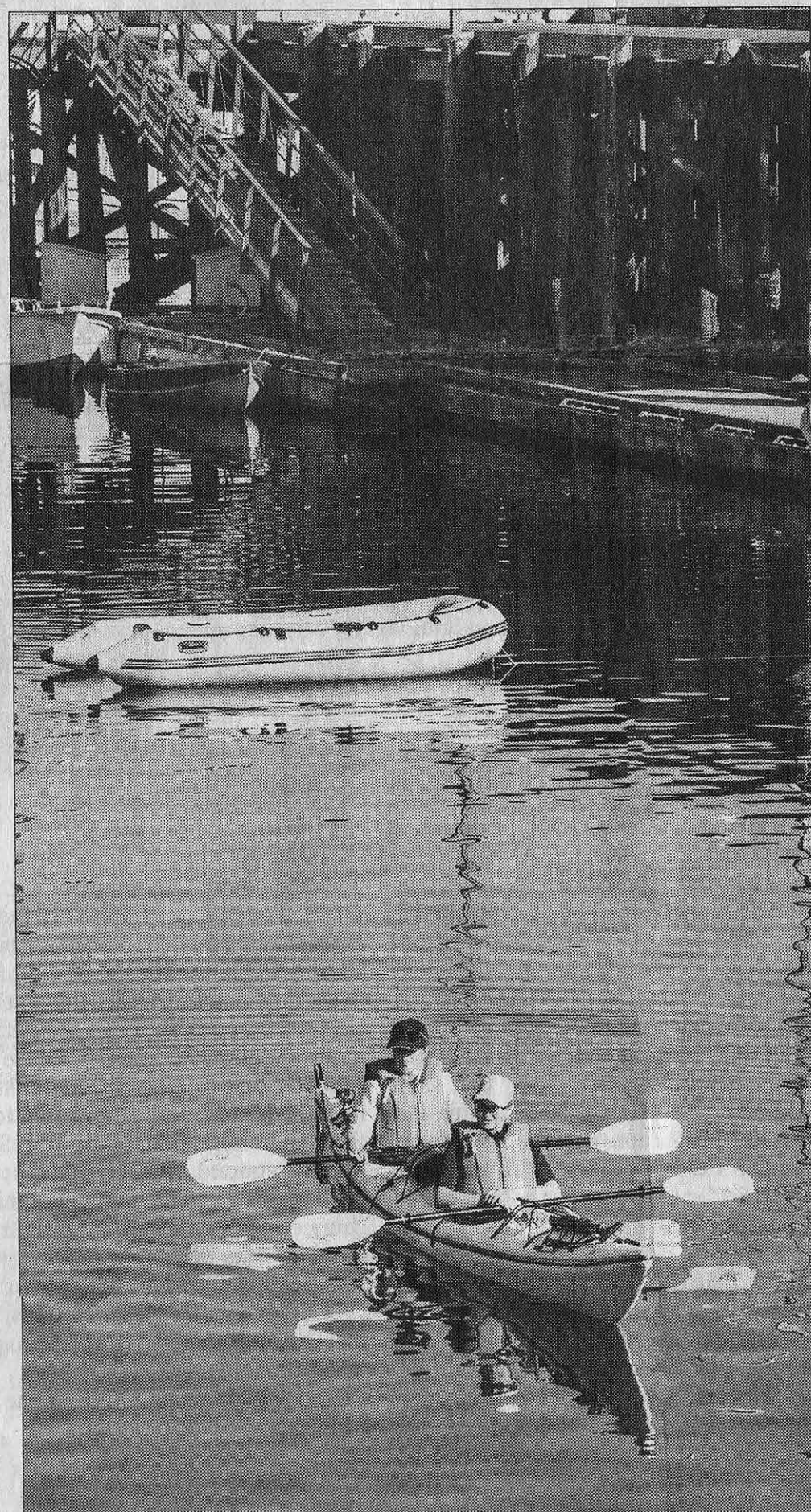
Kayakers head out of the harbor in Ucluelet, Vancouver Island.

Sure enough, the Tomic does the job. By midafternoon we've hooked and landed two kings (Chinook) and a silver salmon (coho). To sweeten this sunny August day we've followed Quadra's ragged coastline, watched sea birds diving for dinner and spotted a pod of dolphins. Pleased, pumped and anticipating grilled salmon for dinner, we ask ourselves what took us so long to get here.