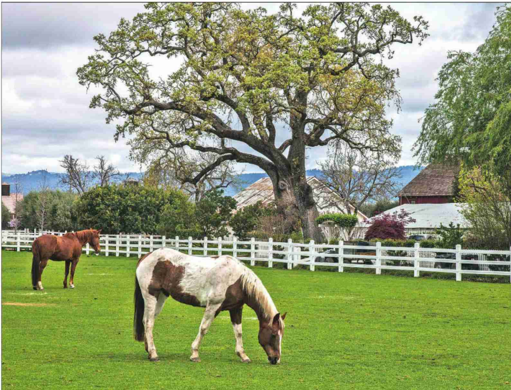
Classic country pastures are part of the landscape at Nickel & Nickel winery and vineyard in California's Napa Valley.