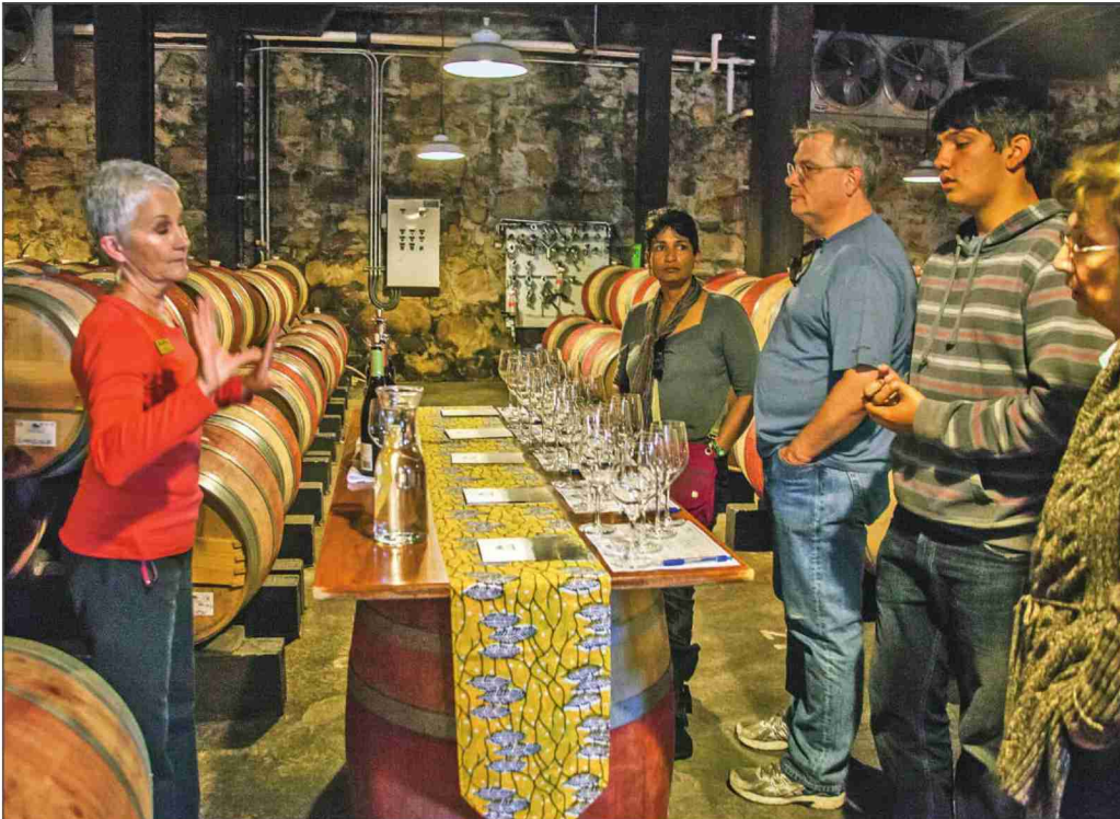
Guests at Hess Estate's Cellar for a wine tasting. Better wineries require a reservation and charge a fee for tasting.