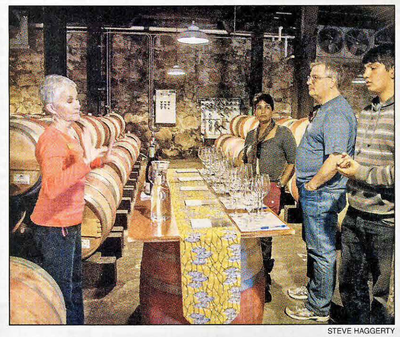
Guests enjoy a tasting flight at the Hess Estate's Cellar in Napa Valley.