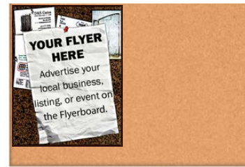
Local display advertising by PaperG

But the butchers, the bakers and the toy makers are still front and center, ensuring that twinkling lights will be there for next year.