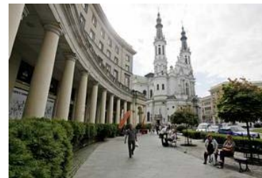
In Warsaw, Savior Square also goes by the name Hipster Square