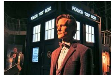
Celebrating 50 years of Doctor Who across the UK