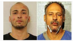
Mugs in the news