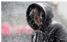
Are you a Chicagoan? Not so fast