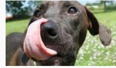
Pets in need of homes