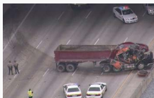
Driver identified in fatal Dan Ryan truck-car...