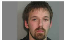
Former owner of destroyed Oak Park bar charged...