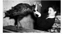
Vintage: Old-time turkey time