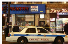
2 shot, 1 fatally, within blocks on West Side

The Tribune is using Facebook comments on stories. To post a comment, log into Facebook and then add your comment. To report spam or abuse, click the "X" in the upper right corner of the comment box. In certain circumstances, we will take down entire comment boards. Our commenting guidelines can be found here ».