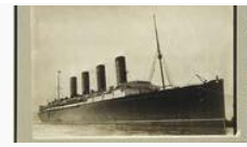
Tragic, historic sinkings

The drive WAS long, two hours on a continuously winding road. But by mid-morning we and 40-odd other travelers were there, seated in four large pangas and motoring slowly