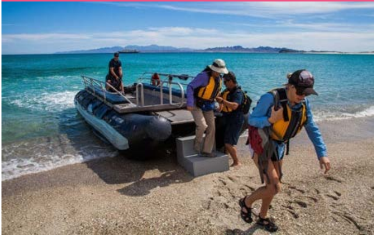
Going ashore at Bonanza Beach, Sea of Cortez, Baja California Sur, Mexico.

Rising at dawn to catch the sunrise, cruise passengers nursing coffee cups watched as the Safari Endeavour glided past the Baja Peninsula's ragged coast. As the rays played over the cliffs, each thumb-shaped cove and crescent beach came into view for a minute or two, then slid out of sight, disappearing astern.