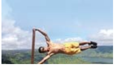
Calisthenics fitness treasure within