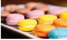
The French sweet invasion