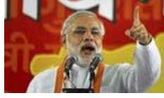
Congress stance on opinion polls puerile, says Modi