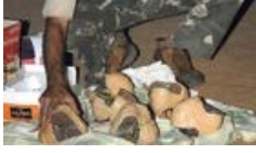
Nine Patna blasts-like bombs found in Ranchi