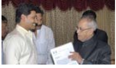
Party leaders meet President over AP bifurcation issue