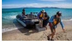
Aboard a floating fortress of solitude in the Sea of Cortes