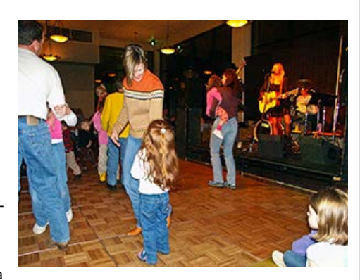
It's party night for kids and adults at Steamboat Ski area's Western Barbecue night.

But fly fishing for trout in the Elk River, as good in winter as in summer, is a more interesting option. Buy an out-of-state license and hire a guide to show you those special trout pools and riffles. Afterwards, pamper yourself at Keystone Lodge's Rock Resorts Spa, a 10,000 square-foot full-service facility, with massage rooms, relaxation therapy, an indoor swimming pool, a sauna and hot tubs. Powered entirely by solar and wind-turbines, and partially lit by natural light, this officially "green" spa uses only natural products.