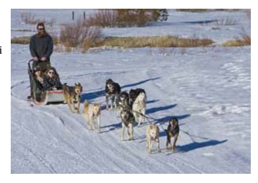
Dog mushing is increasingly available at ski resorts.

But the latest addition – a bonafide extreme sport – tops them all. Test your mettle here – and bone up for your "Survivors" debut – on the Ice Tower, a 60-foot ice climbing feature created from cross-braced telephone poles encased in a three-foot thick layer of blue ice.