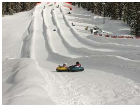
Tubing rules on Dercum Mtn., Keystone ski resort.

How does fly fishing in Keystone's Elk River grab you? Ice climbing at British Columbia's Big White resort? Paragliding off Aspen Mountain? Heart-thumping thrills with your second-grader on Park City Resort's Alpine Coaster, or bungee-bouncing at Telluride? Fishing, mushing, mountaineering, all these and more are part of winter's new profile. For thrills in the white zone, here are a few of the top contenders: