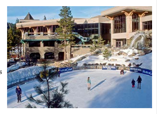
Ice skating at the Squaw Creek Resort, near Squaw Valley U.S.A. Ski area, Squaw Valley, CA.

And there's plenty of non-ski fun, from tubing, dog mushing, and snowmobiling, to sleigh rides-plus-dinner and heli-ski tours.