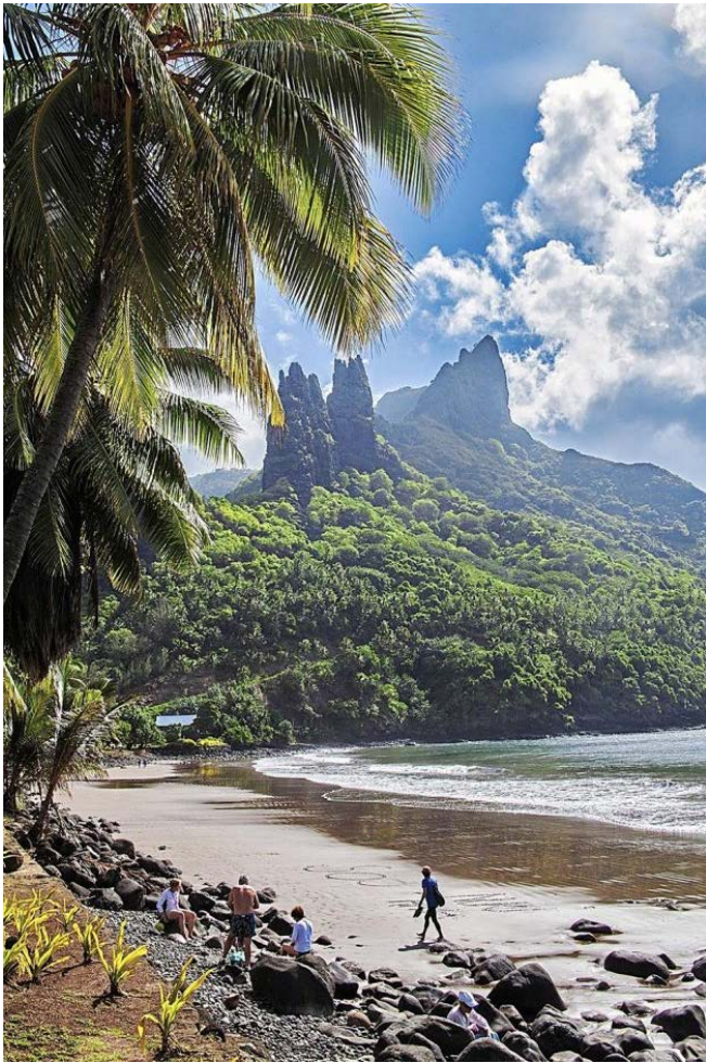
Visitors can explore near-empty beaches on Nuku Hiva..

When an electrical short shut down one of the Aranui 3 's compressors, cutting cool air to the lower decks, most of the 119 passengers on board chose to stay with the ship. Thirty-one accepted the captain's offer to fly back to Tahiti. But with three days at sea ahead of us, a gang of mavericks – square pegs run amok – dragged their bedding off their bunks and up to the top deck.