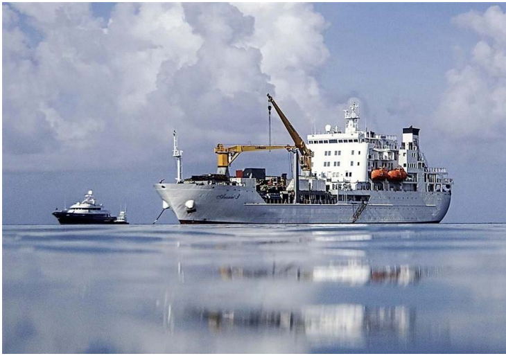
The Aranui 3 anchors in the Pacific Ocean off Fakarava Atoll in French Polynesia.

Which was why the freighter Aranui 3 , sailing out of Papeete, in Tahiti, seemed the way to go. A throwback to the commercial schooners of old, she sails twice a month, delivering cargo to isolated villages on six of the archipelago's 12 islands: Nuku Hiva, Ua Huka and Oa Pou, in the north, and Hiva Oa, Fatu Hiva and Tahuata, in the south.