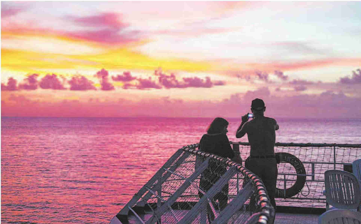
Passengers take in a South Pacific sunset off Ua Huka in the Marquesas Islands.