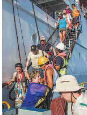
Aranui passengers descend the gangway on Nuku Hiva.

Contacts: For general information, go to www.aranui.com ; for dates and prices, go to www.itahititravel.com .