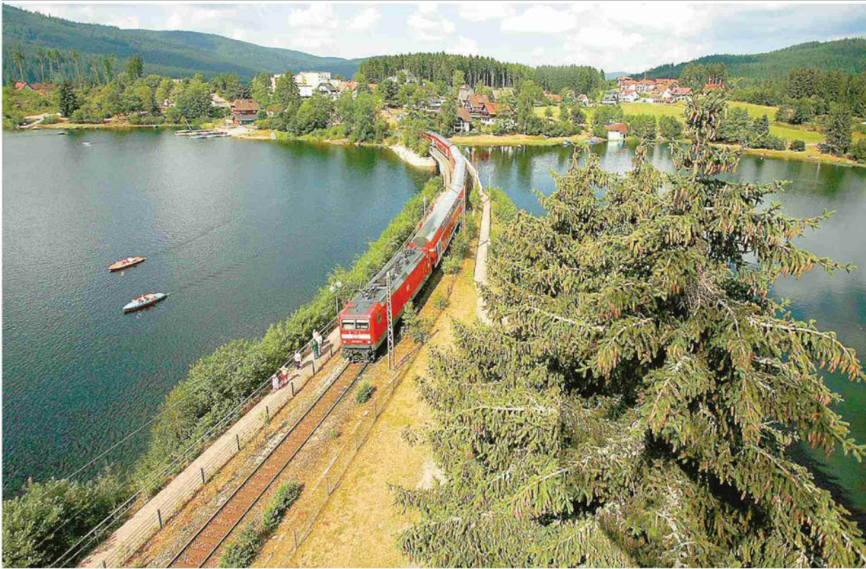
A regional train crossing the Schluchsee near the Black Forest, Germany.