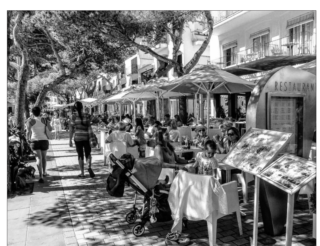
Summertime means sidewalk cafes (and maybe a little gazpacho or sangria?) in the village of Llafranc.