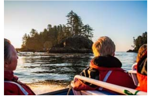
Islets here, islets there, and everywhere in the Broken Islands, Ucluelet. Vancouver Island. B.C.

At first glance, Ucluelet looks like any other end-of-the-road fishing village. But a walk along the road, past little homes, around the lighthouse and along the Wild Pacific Trail, reveals what may be the