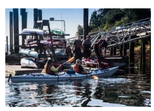
A kayakers heaven awaits in Ucluelet Harbor and the Broken Islands, Ucluelet, Vancouver Island, B.C.

Why so early? When the tide is out, the bears emerge from the forest to look for food in the exposed inter-tidal zone. Digging in tide pools and under rocks and logs, they're dark brown and black coats are easy to spot. So before the sun was over the tree tops, our group of 12 was already beyond the harbor, speeding toward the coastal archipelago