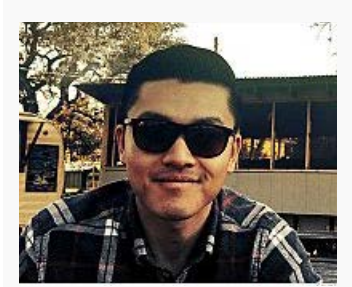
CNN Money: How Young Millionaires Invest CNN Money