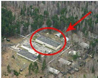
10-Million Square Foot Tech Base Revealed Money Morning