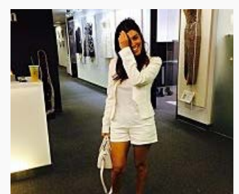
Woman Shouldn't Come as a Surprise (VIDEO) Stirring Daily