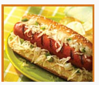
5 Hot Dogs With A Delicious Twist Hebrew National

20 Athletes that Died Before Their Career Was Over Rant Sports