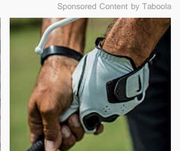
The #1 Reason the Average Golfer Can't Break 90 (or even 100)... Revolution Golf