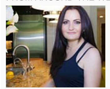
Goodbye Granite: Hot New Countertop Finishes Reviewed.com