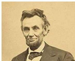
George Clooney's Secret Family History