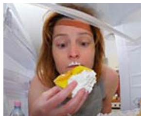
Seriously, Stop Refrigerating These Foods