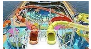
Carnival Breeze renderings