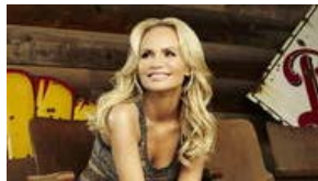
Cruise ship godmothers