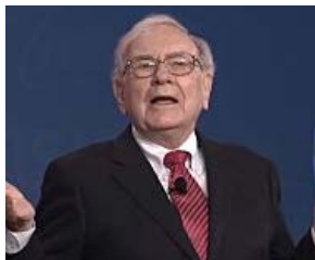
Warren Buffett Reveals How Anyone With $40 Could Become A Millionaire