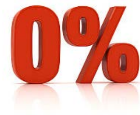
Best 6 Credit Cards with No Interest to Help You Get out of Debt