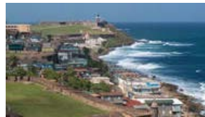
Ports of Call: Profiles of popular cruise destinations