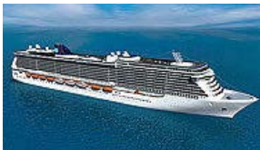
New and soon-to-arrive cruise ships

Reporters and editors involved in creating and writing these cruise articles are in no way affiliated with any links that are placed on the pages. Read our full editorial policy.