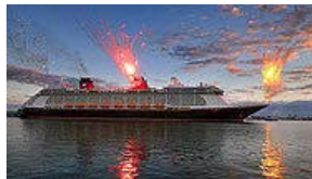
Disney Fantasy pictures