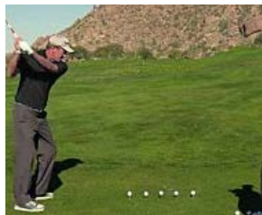
Classic golf mistakes amateurs make at the tee