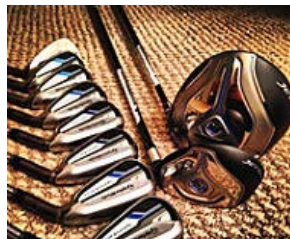
How People are Paying Next to Nothing for Brand New TaylorMade Jetspeed Clubs