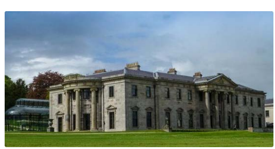
Ballyfin Manor, a late-Georgian structure, added a glass and iron conservatory, on the left, in the 1850s.