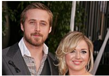
15 Cool Siblings In Hollywood You DIDN'T Know About Refinery29