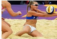
30 of the Hottest Women's Beach Volleyball Players on RantSports