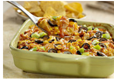
Delicious Monterey Chicken Tortilla Casserole CampbellsKitchen.com