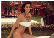
PHOTOS: 30 Hottest Female Athletes We Can Be Thankful for in RantSports