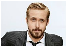
20 Actors Who Are Actually Terrible RantLifestyle