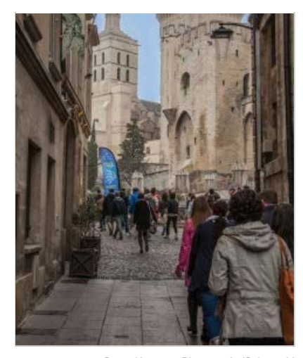
Inside its walls, Avignon's narrow streets, designed for foot traffic, invite river cruise passengers to explore.

balcony (sliding glass doors with exterior railings.)