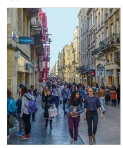
Tourists and cruise passengers stroll Bordeaux's streets in summer.

"We introduced 10 new ships last year and will christen 18 more this week. And 10 more are due to come on line in 2015."