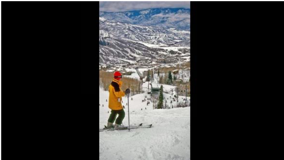
Snowmass Village seen at Snowmass Resort, Colorado.

This article is related to: Hotels and Accommodations, Dining and Drinking, Trips and Vacations, Restaurants, O'Hare International Airport