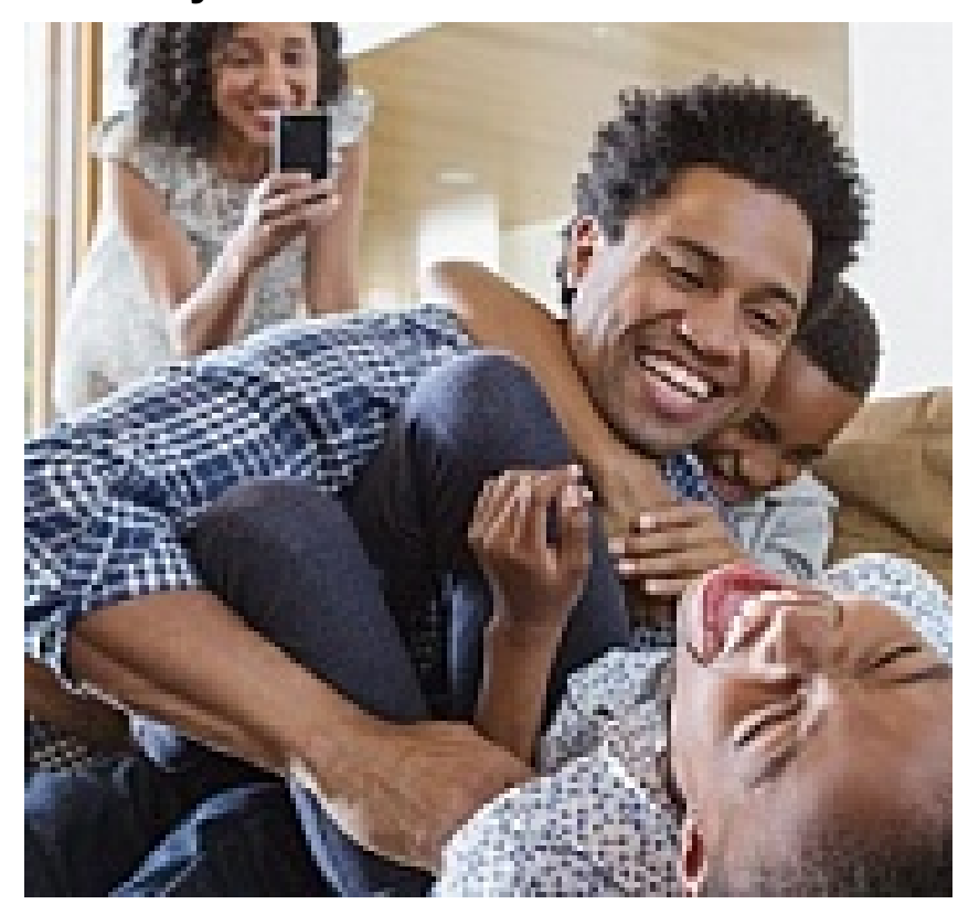
Switch to Verizon & get $150 bill credit per line. New 2 yı activation req'd.