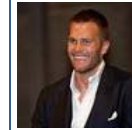
The Richest NFL Quarterback Ever will Surprise You (Worthy)