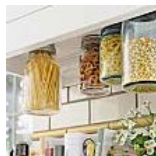
Stop Household Clutter: 15 Things to Get Rid of