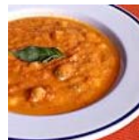
Dinner for One: Meals sized just right for solo