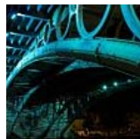
Woman plunges to her death while trying to take a