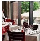
Throwback Thursday: Braised Lamb Shanks with