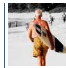
Why? (The Motley Fool)

Like all resorts in their first year or two — Villa del Palmar opened in the spring of 2011 — some problems surfaced. I heard about misplaced reservations, errors in bar charges and guests who had paid in advance for the all-inclusive option but were repeatedly asked to sign bar chits anyway. Computer glitches were blamed for losing room requests and timeshare owners' names.