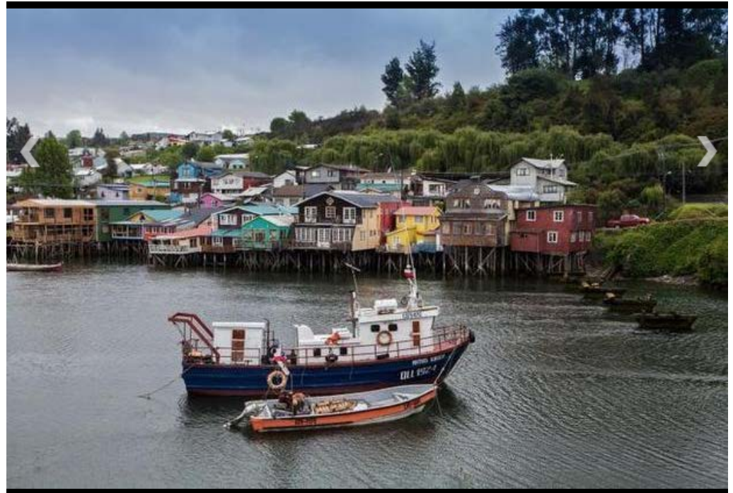
"Palafitos," wooden stilt houses, some centuries old, line the west shore of Fiordo de Castro bay in Chiloé, Chile.

The next time, visit in autumn — March and