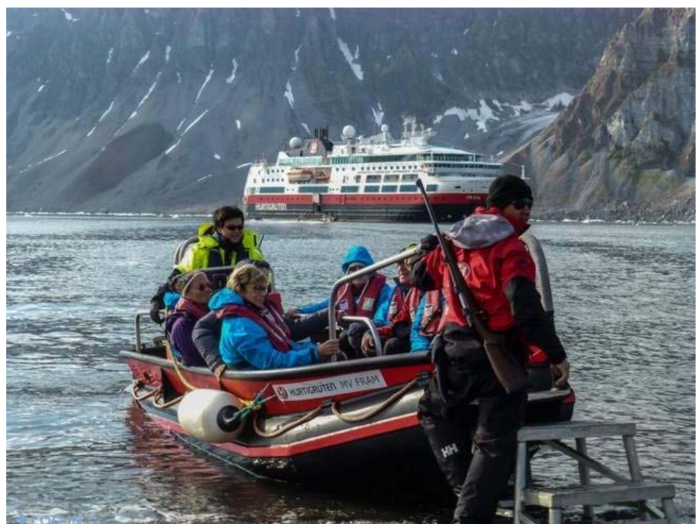
Passengers come ashore in Burgerbukta Bay, the MS Fram at rear.