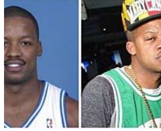
Tragedy: 10 Basketball Players That Have Aged Badly