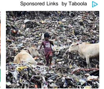
Extreme Poverty Fallen By Half In 15 Years