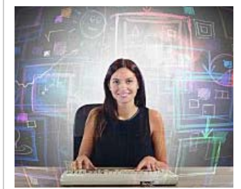
Who is really the best website builder of 2015?