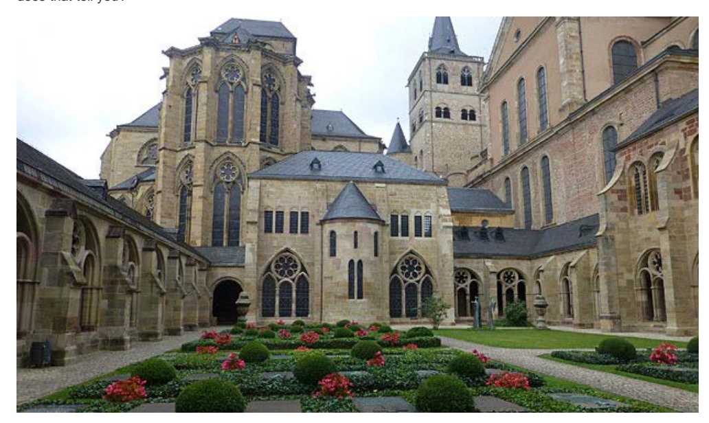
The cloister, now a garden, links the Romanesque Cathedral to the Liebfrauenkirche.