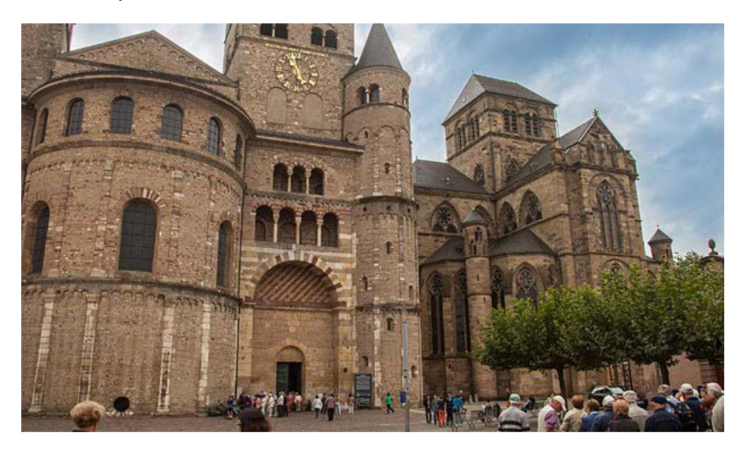
Trier Cathedral and the Liebfrauenkirche church combine Romanesque, Gothic and baroque architectural styles.

The first building on the site was a square Roman structure, possibly a palace.