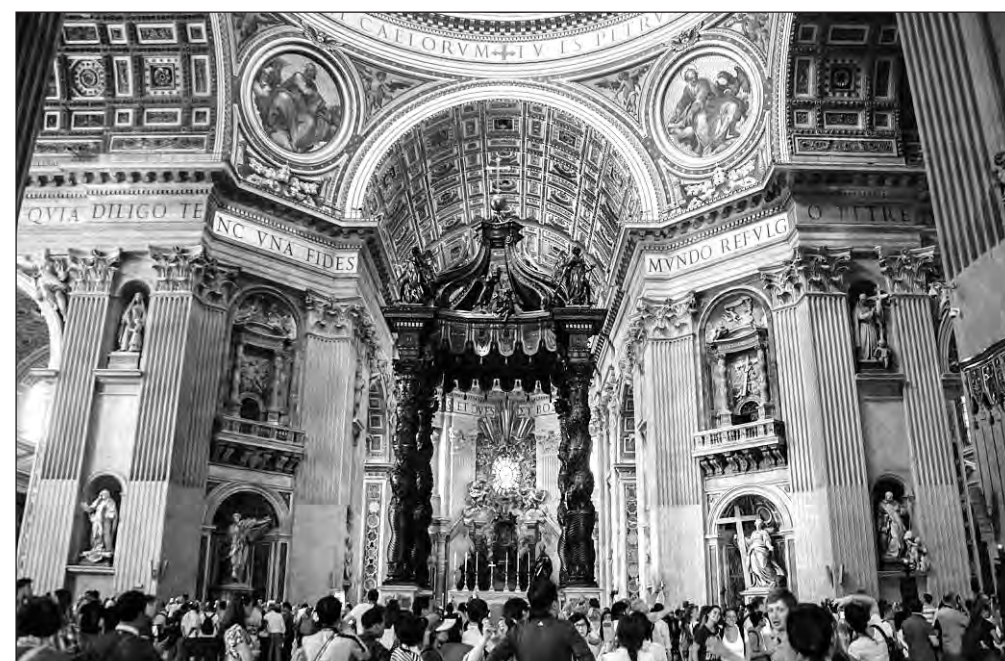
Left: The Vatican City's Swiss guards, often seen standing at attention, offer assistance to tourists with questions. Right: Crowds in St. Peter's Cathedral in Rome push up to the railing in front of the Baldachin and main altar.

on your own. You can go at your own pace, hurry through some galleries, linger in others or stay all