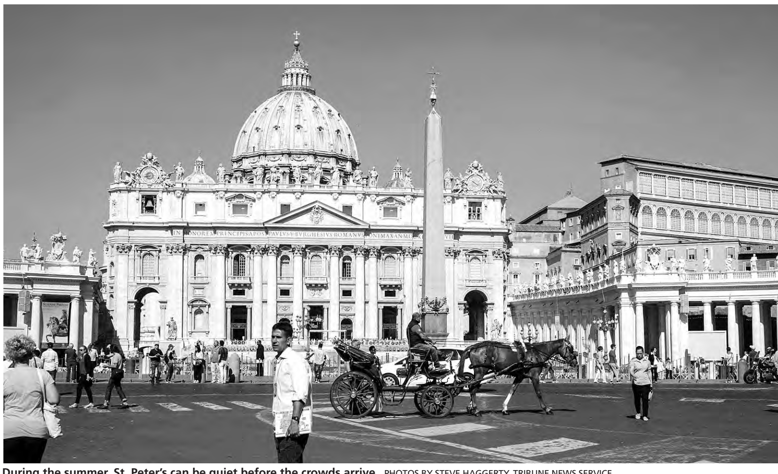
During the summer, St. Peter's can be quiet before the crowds arrive.

We still had to get in a line behind two earlier groups. Tours get preferential treatment so you'll never avoid some lines. And by the time I arrived, the galleries were already crowded. The rule here and at most of Rome's other museums — seems to be that once your group is through the door, you're