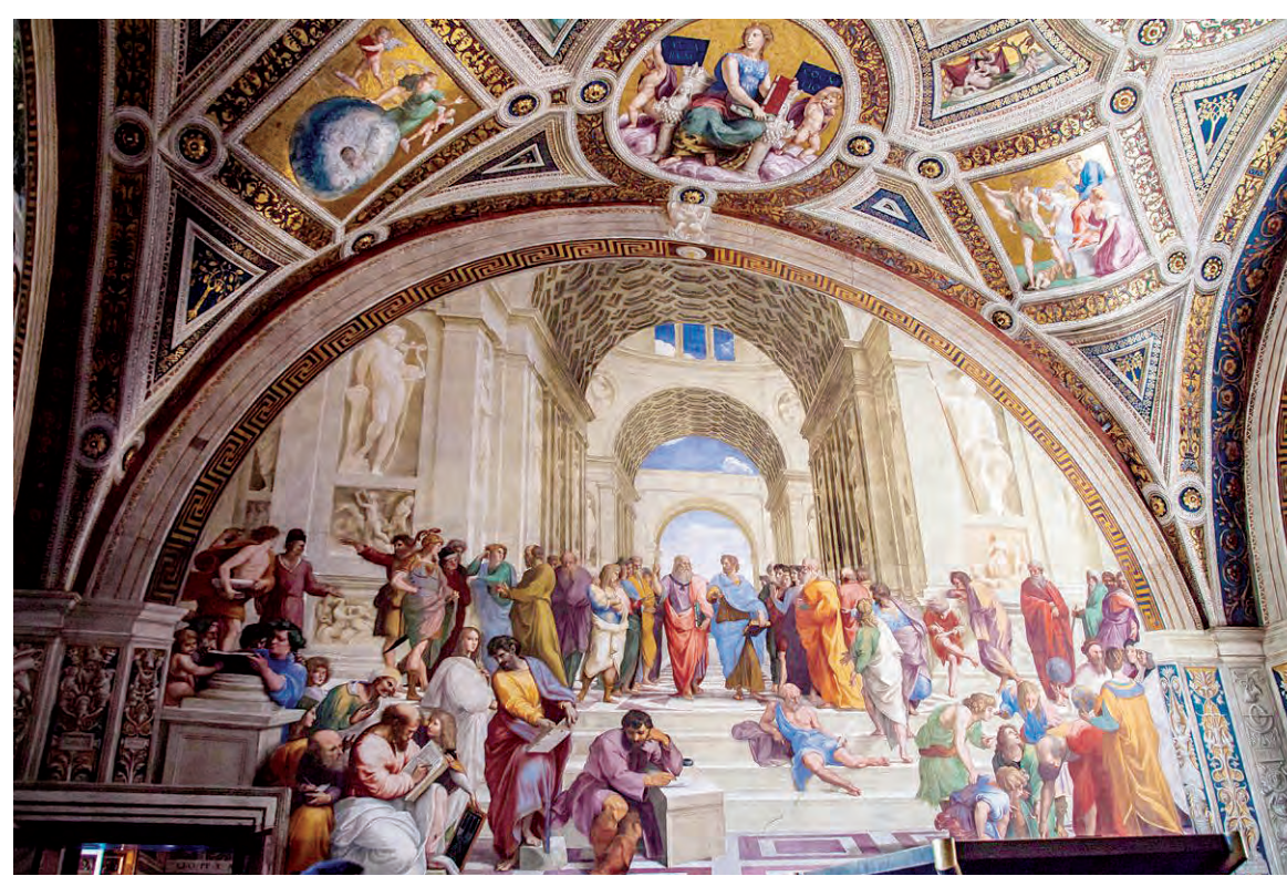
A highlight of the Vatican Museum is the The School of Athens, a fresco painted in 1510 by Raphael. Plato is at centre left, standing next to Aristotle; Raphael's self-portrait, in a black cap, is at lower right.