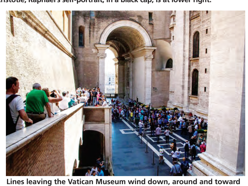
the entrance to St. Peter's. It doesn't have to be that way.