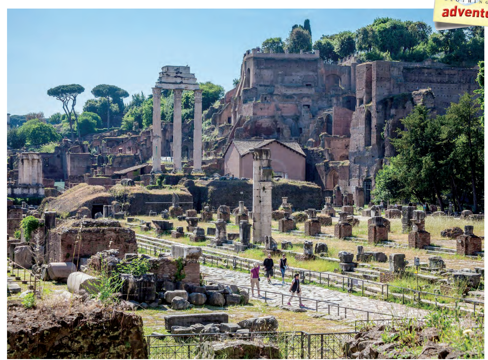
Restoration work at the Roman Forum is a never-ending project that continues to reveal ancient structures.