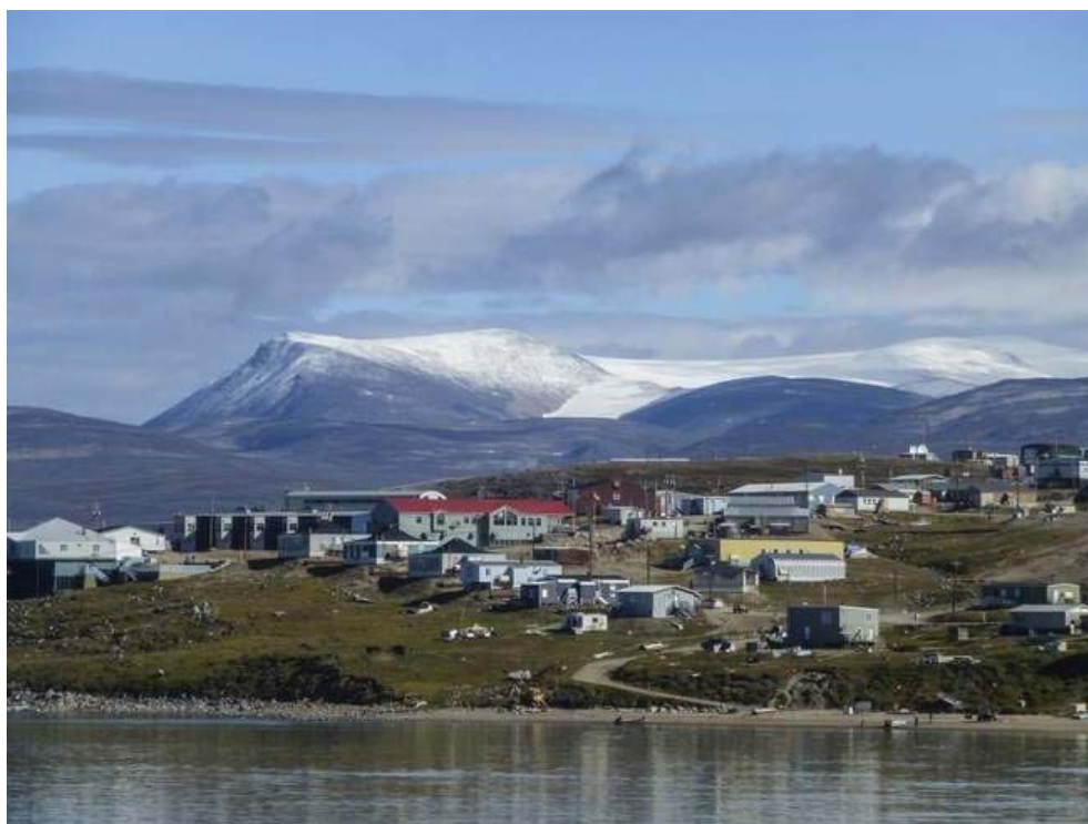
Pond Inlet, an Inuit village established by the Canadian government, is located in Northern Baffin Island, Nunavut, Canada.