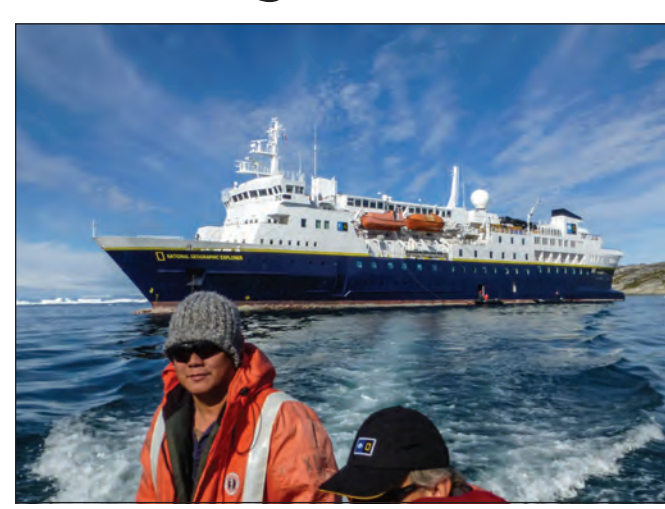
Passengers going ashore by Zodiac heading for the Ilulissat harbor dock in Ilulissat, Greenland as part of an Arctic cruise.