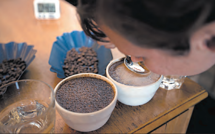
A curious coffee lover inhales the aroma from a freshly brewed cup of Central American coffee at the Stumptown Coffee Annex. Daily "cuppings" at 3 p.m. offer aficionados an opportunity to explore different coffees.