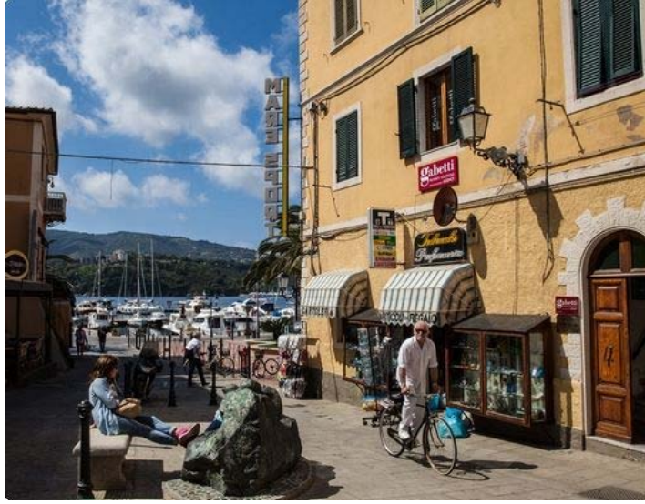
Life moves slowly on the cobblestone streets of Porto Azzurro, island of Elba.

News Opinion Sports Life Weekend Business Weekly Berks Country Obituaries Marketplace Classifieds Special Sections