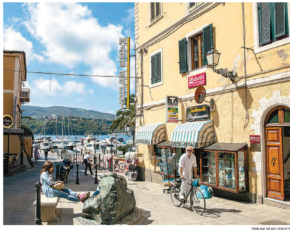
Life moves slowly on the cobblestone streets of Porto Azzurro, island of Elba.

If you're a fact-freak, you may know that that Elba is the island where Napoleon,